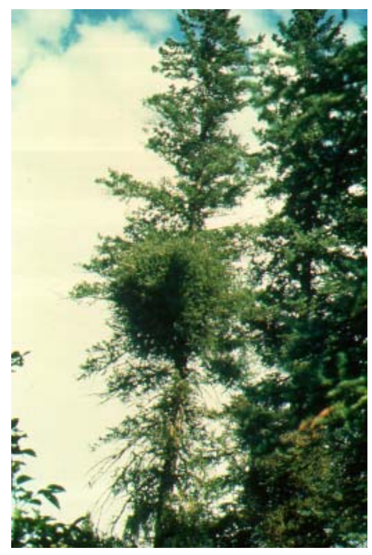
Witches' broom caused by dwarf mistleloe infection.

For removal in lightly infested trees, infected limbs should be pruned at the nearest crotch. Heavily infested trees should be removed and replaced with trees that are not hosts. Completely removing dwarf mistletoe from a stand of trees results in control for many years since new introductions will spread very slowly. Lightly to moderately infested mature trees in which less than 50% of the limbs are infected may survive for decades. However, it is important not to plant susceptible trees under infected trees.