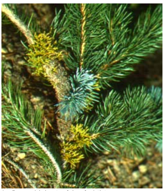
Leafless aerial shoots of dwarf mistletoe on spruce.